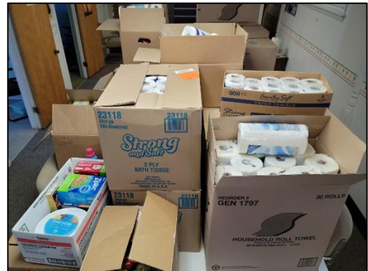
A portion of the truck-load of paper products and cleaning supplies delivered by United Health Care for the Food Pantry.

Our own Annual Conference will be held online from 2-6 p.m. on Sunday, 6/6, and from 8:30-4:30 p.m. on Mon., 6/7.